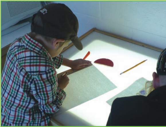
Kindergarteners at Jewish Beginnings learn and explore, building a strong foundation for their future education.