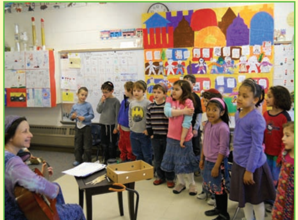
Kindergarten and first grade students at Hillel Academy shared their knowledge and love of Torah at the 2010 Hillel Academy Torah Fair.