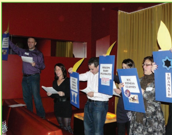
Our Young Leadership Division brings together the next generation of Jewish Milwaukee to nurture commitment and leadership skills. The December YLD Latke Vodka event, pictured here, was a great success.