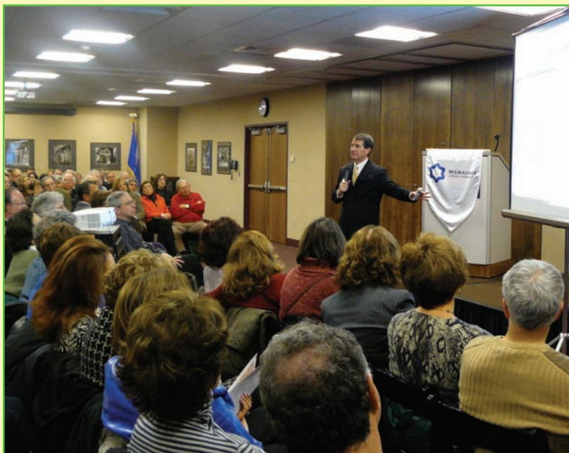
Left: The "Dead Sea Scrolls & the Bible" exhibit at the Milwaukee Public Museum brought together nearly 800 members of our community in late January.