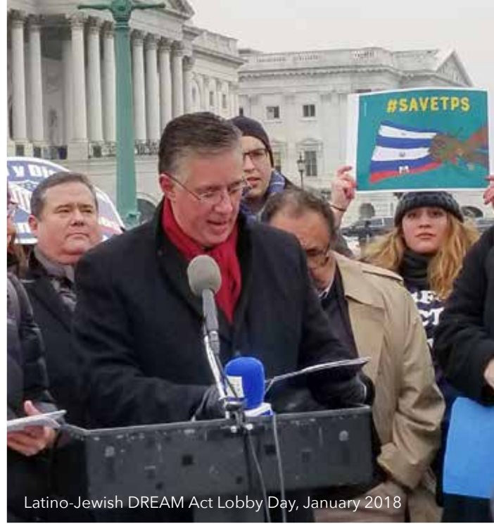
Latino-Jewish DREAM Act Lobby Day, January 2018