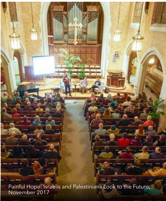
Painful Hope: Israelis and Palestinians Look to the Future, November 2017