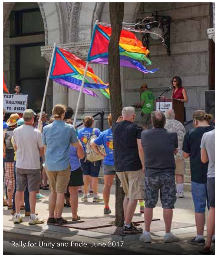
Rally for Unity and Pride, June 2017