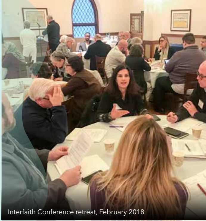
Interfaith Conference retreat, February 2018