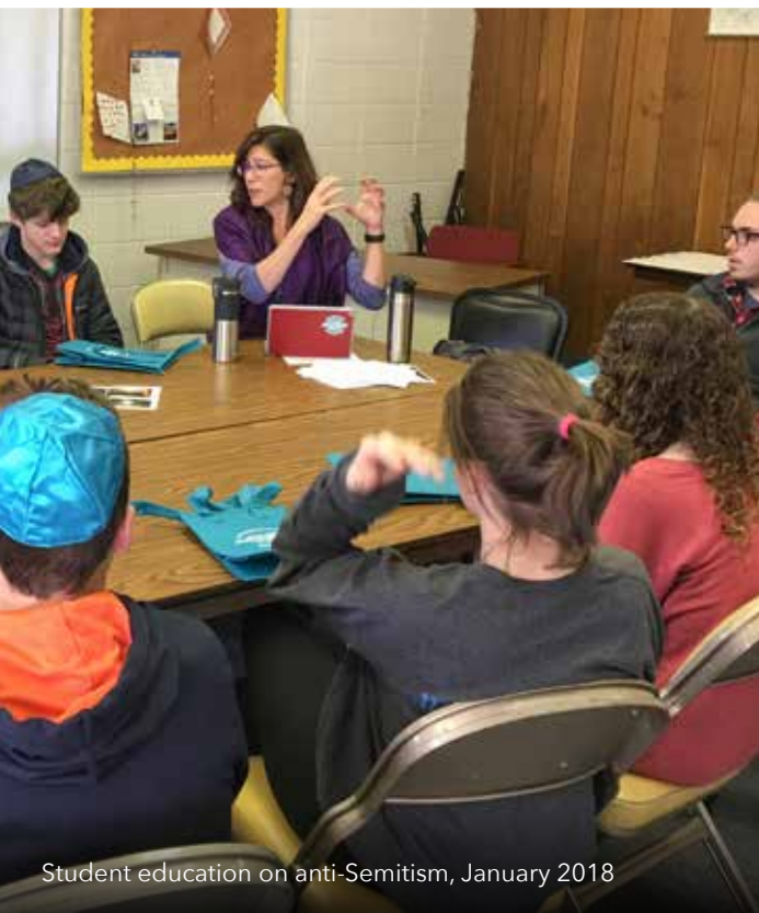
Student education on anti-Semitism, January 2018