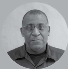
Tommy Rice School Support Award