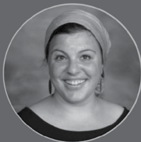
Mara Kleiman Teacher Impact Award