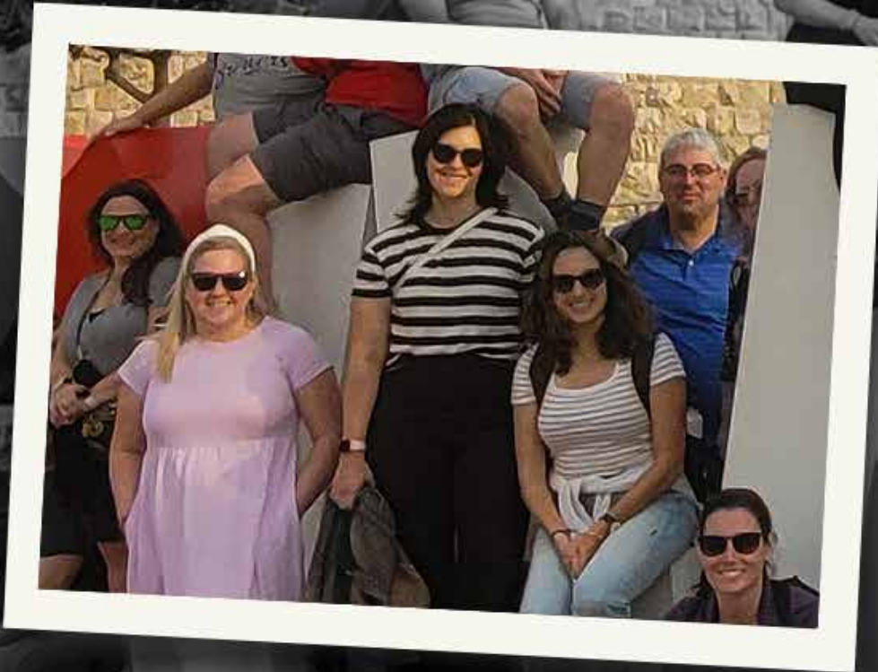
The Weinstein 8 cohort in Israel.