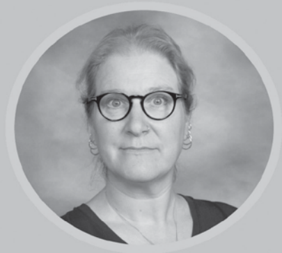
Susan Gray School Support Award Lunch and Catering Specialist